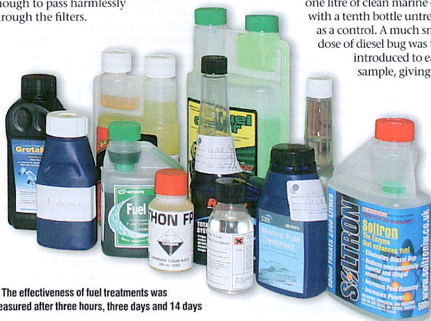
▲ The effectiveness of fuel treatments was measured after three hours, three days and 14 days

For the prevention test , the nine fuel treatments were each added to one litre of clean marine diesel, with a tenth bottle untreated as a control. A much smaller dose of diesel bug was then introduced to each sample, giving a