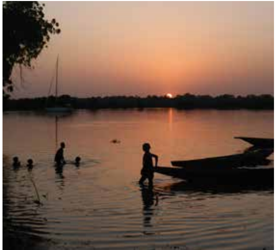
Sunset over Kuntaur, River Gambia