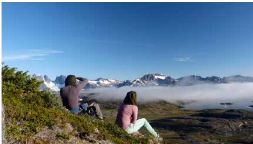
Appamiut - best anchorage in Greenland, apart from the mosquitoes

After a morning of fog, it cleared and we motored across Disko Bay before picking up a light breeze to sail past some huge icebergs. As we approached Ilulissat, we first saw a mirage of the larger bergs, then the ice in the ice-fjord, and finally the river of thousands of bergs heading north.