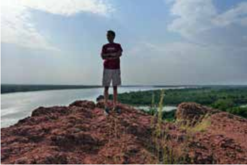
Red Hill, Kassang, Gambia

which was surprising as we were taking anti-malarials. By now friends and family were worried and between them mobilised the Army Medical Corp and half the UK's university research groups. We were put in touch with a friend of a friend at the Medical Research Council in Banjul who confirmed I didn't have malaria, though it was no clearer what I did have. By this