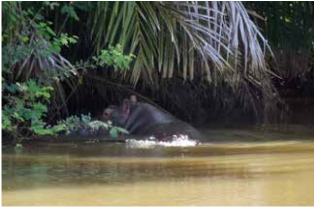
Hippo, River Gambia

In the nature reserve around Baboon Island, we were boarded by one of the rangers (a recent rule) who, despite our reservations, proved a great guide. He spotted a chimpanzee in the bushes and it was interesting to hear about their habits and behaviour. He also encouraged us to go near the banks - something that the pass we had been given in Banjul forbade at this point - so we had great views of egrets, cormorants, herons, kingfishers and