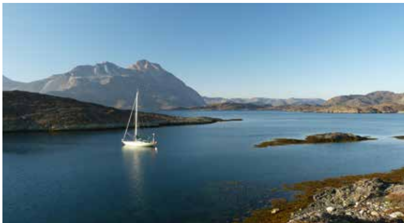
At anchor in Manitsoq, off Isbergsund, SW Greenland

Our next stop was Unartoq, a small island with a hot spring, which the Norse apparently knew about, though we couldn't find any reference to it in the sagas. We spent a surreal half hour sitting in the small pool drinking beers with icebergs behind us. We had been studying the weather for a few days to find a good time to head back across the Atlantic and, with an opportunity opening up, decided to keep moving. After a rainy evening anchored in a bay off Nanortalik, we entered the fjord system near the