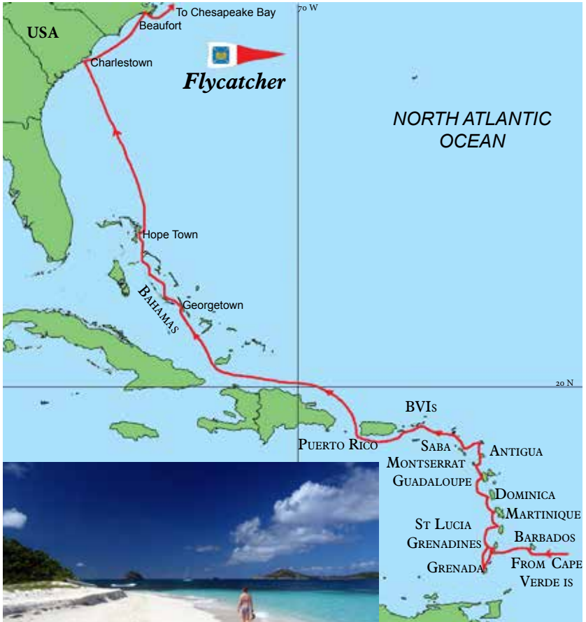
White Island, Carriacou

a tired and thinner crew that arrived in the Cape Verde Is. Fortunately, we quickly discovered the national dish of Cachupa - fish or meat fried with maize and beans and topped with an egg or chorizo. A few meals of this washed down with suitable amounts of beer and we were back to strength.