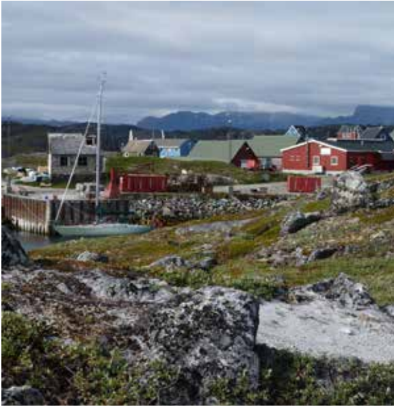
Flycatcher on the wharf at Qeqertarsuatsiat

We went on to Battle Harbour, known locally as the capital of Labrador when cod was at its peak. It used to be full of schooners, had a Grenfell Mission Hospital, and was the base from which Peary broadcast his news of reaching the North Pole. It has been restored as a museum and we enjoyed learning about the history, as well as the present from a fisherman on a shrimp factory boat. After getting stores in Fox Harbour we spent a night in the excellent natural harbour at Petty Harbour, another abandoned outport. We had read that Labrador had two seasons, winter and July. With July just starting, we were tempted to work further up the remote coast, but wanted to press on to Greenland, so consoled ourselves with thoughts