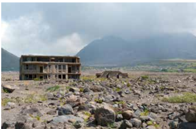
Buried houses in Plymouth, Montserrat