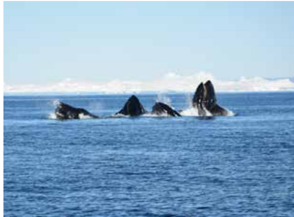
Humpback whales feeding in Disko Bay, Greenland

thought a little unfair. We negotiated showers at the fish plant, stocked up and followed the inner leads for six days north to Nuuk. These leads snake between striking islands and skerries of granite and are at best sporadically marked and charted. They are a positive motorway in Greenland though – being the only way of getting between towns and villages, except by air. We had a foggy and cold time of it with light headwinds, but enjoyed the exploring. We