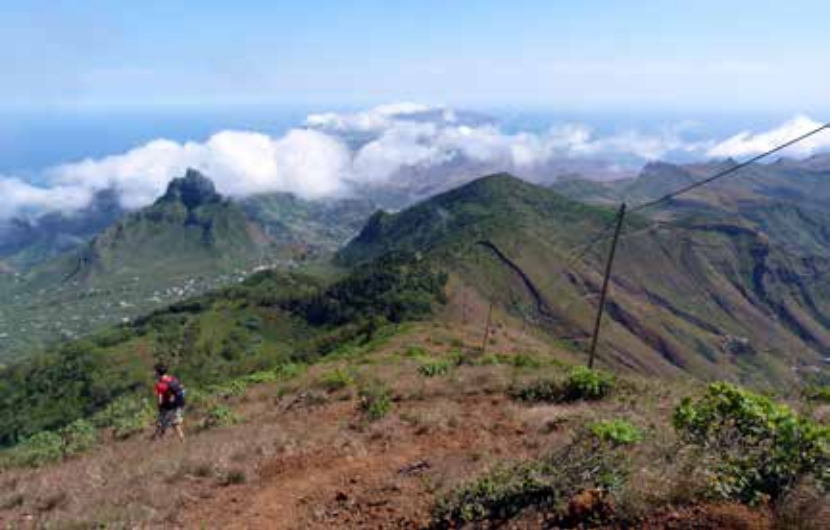
Walking on São Nicolau in the Cape Verde Is

Once at sea, we both felt unwell and soon started vomiting. As we were now fetching in 20kts of breeze we put this down to losing our sea legs up river and kept ourselves hydrated while we recovered. It was only after a