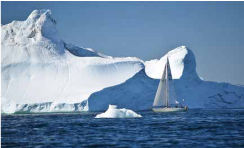
Flycatcher and ice, Disko Bay

spent nights at two deserted Faroese fishing stations, Ravens Storø and Færingehavn, as well as tying with lines ashore amongst the skerries. We also stopped at the small village of Qeqertarsuaatsiaat where we had the rare treat of a dry and sunny walk and took advantage of the local supermarket. These not only sell excellent Danish-style bread, pastries, fruit and veg, but also rifles, ammunition, flotation suits, anchors, and a whole host of other useful items, alongside whale and narwhal and other unidentified meats. At Amitsoq, in the fjord south of Nuuk, the weather improved and we had a