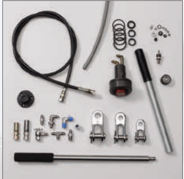
Accessories and Fittings