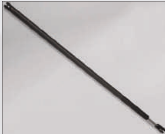
Hydraulic Boom Vang