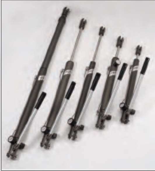
Hydraulic Integral Adjusters

As boats get bigger and headstays longer, both easy adjustment and accurate backstay tension become increasingly important. The solution to this is hydraulics.