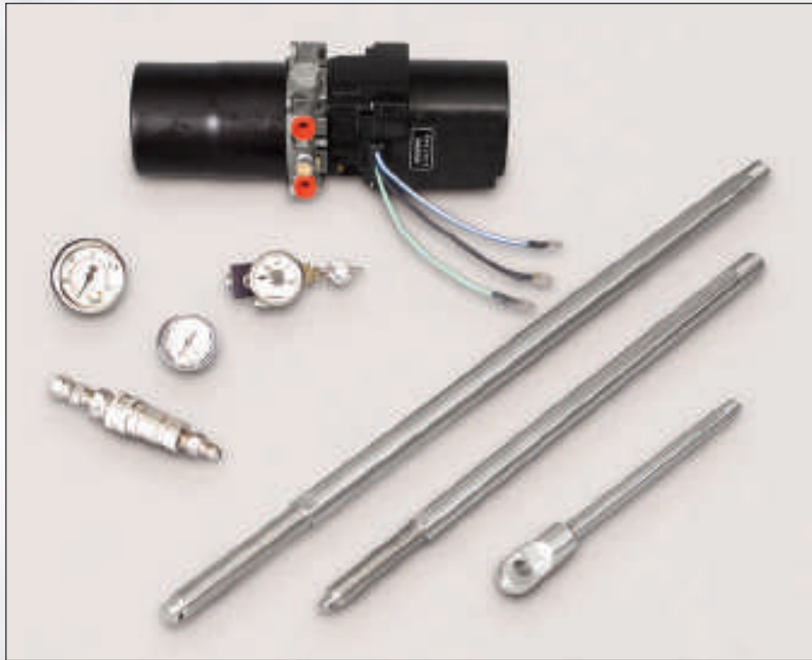
Power Pak and Custom Items