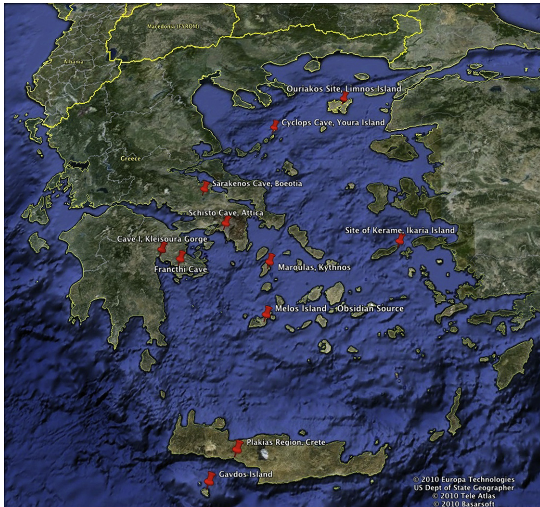
Fig. 2. Sites mentioned in the text.